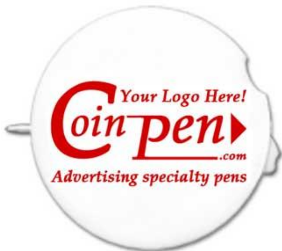
Front side of Coin Pen