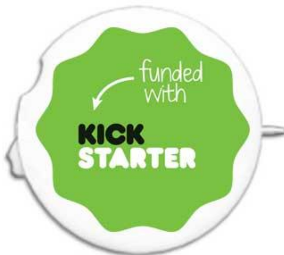
Back side of Coin Pen